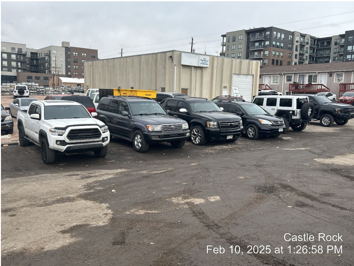
Castle Rock Feb 10, 2025 at 1:26:58 PM