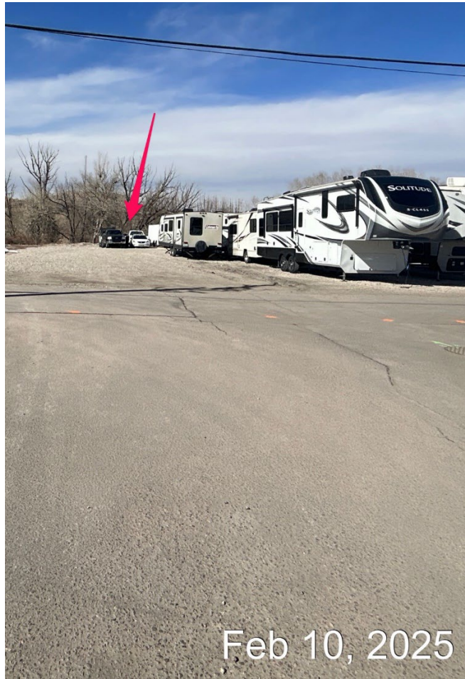
Feb 10, 2025