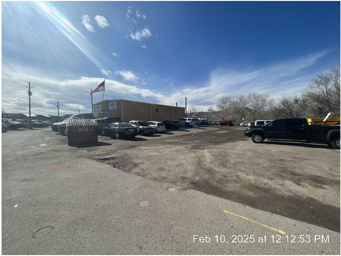
Feb 10, 2025 at 12:12:53 PM