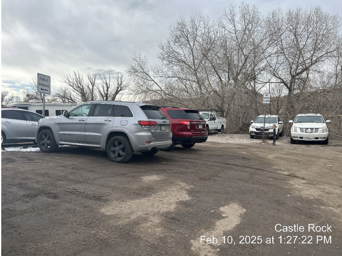
Castle Rock Feb 10, 2025 at 1:27:22 PM