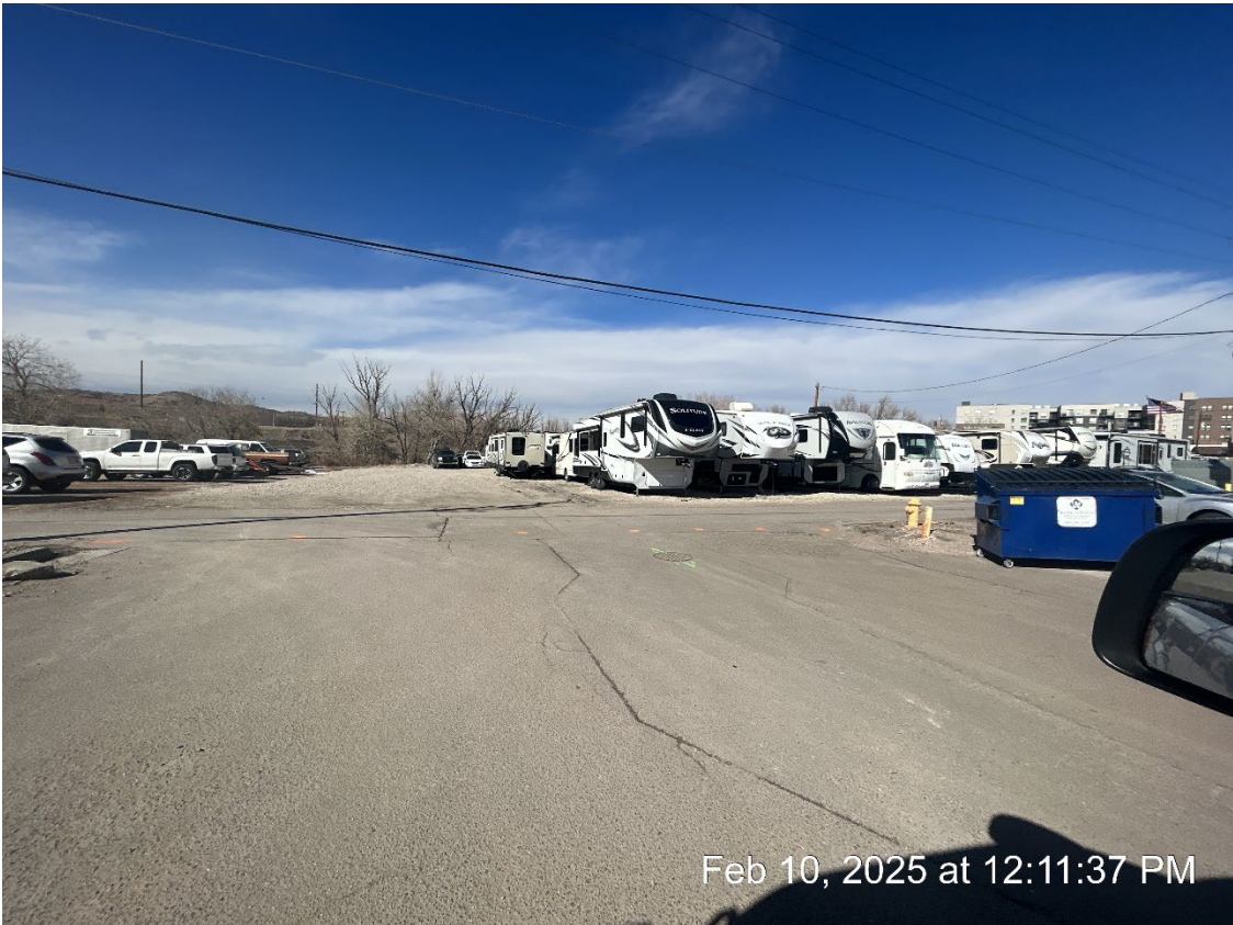
Feb 10, 2025 at 12:11:37 PM