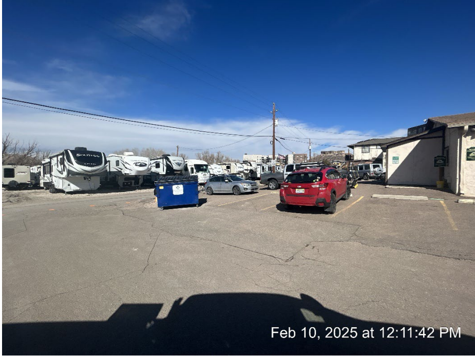
Feb 10, 2025 at 12:11:42 PM