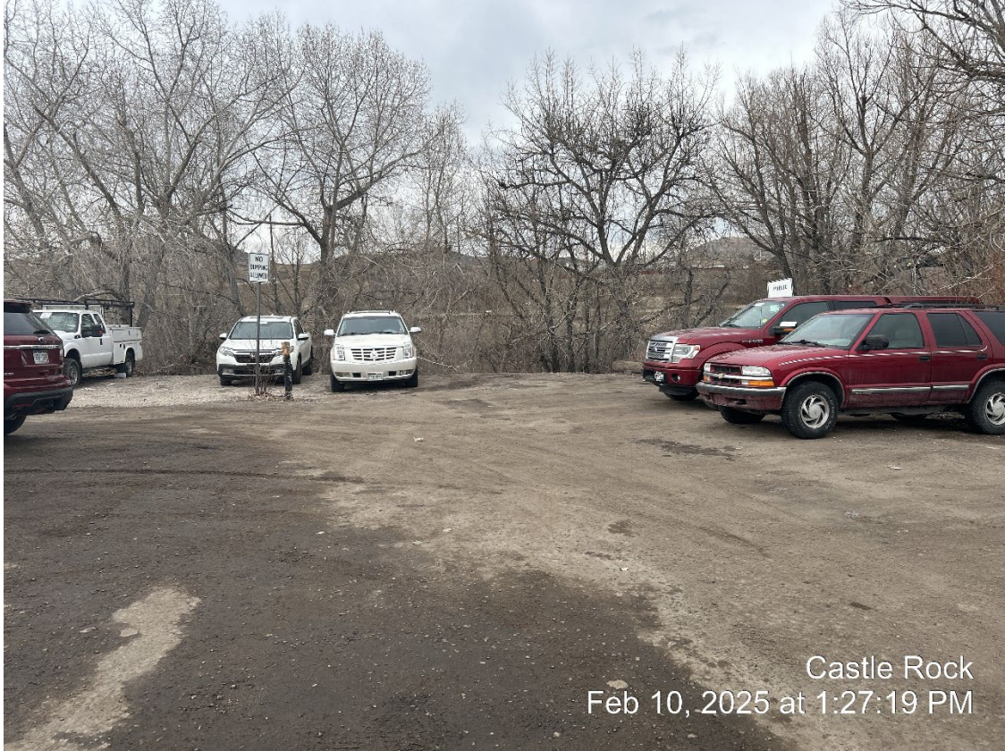
Castle Rock Feb 10, 2025 at 1:27:19 PM