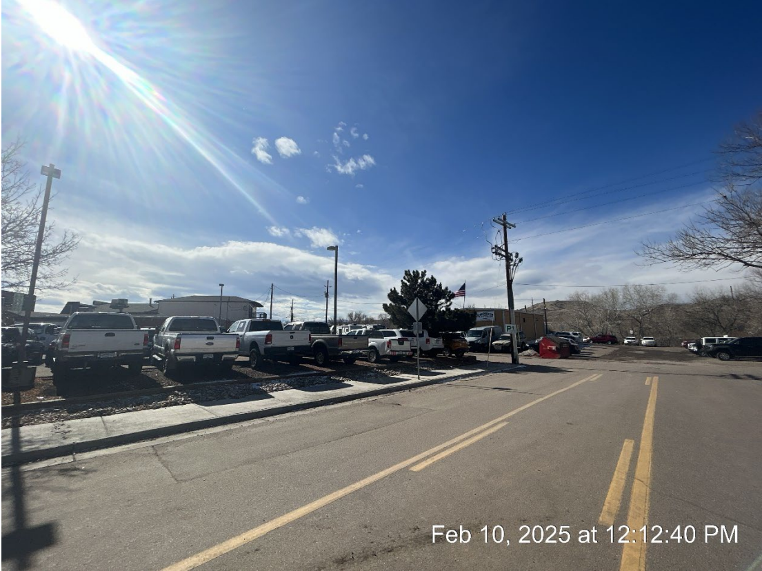
Feb 10, 2025 at 12:12:40 PM