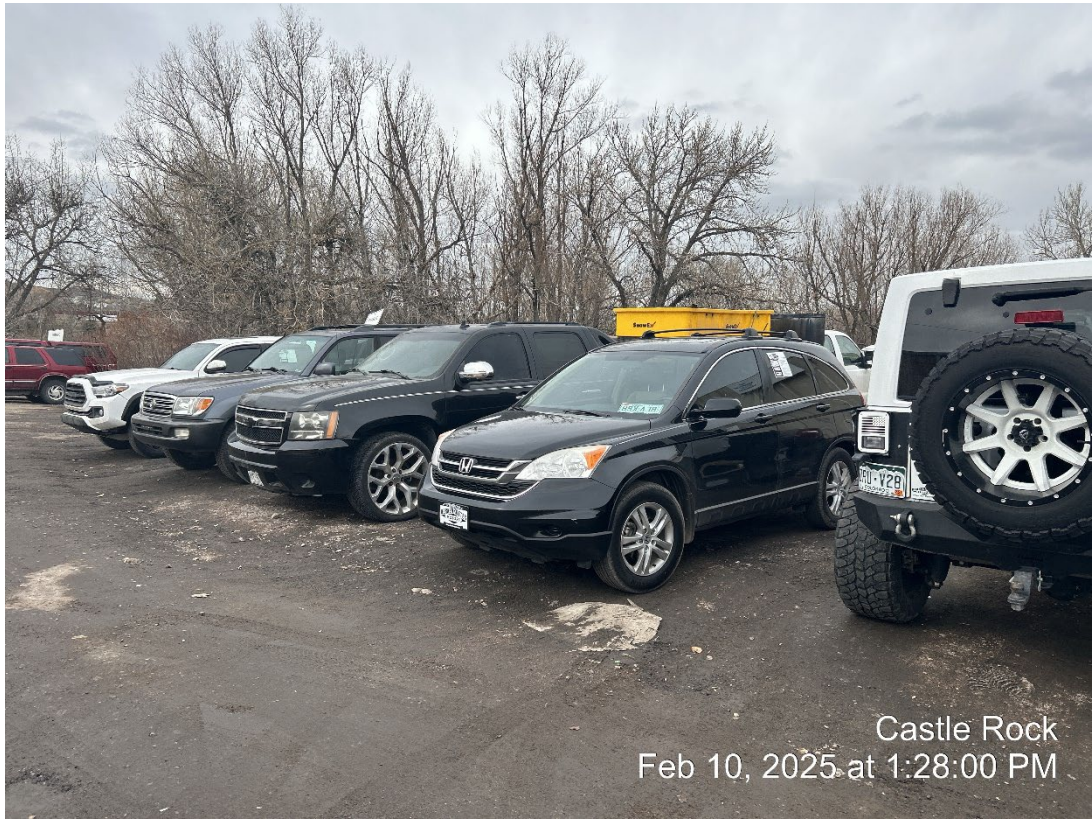
Castle Rock Feb 10, 2025 at 1:28:00 PM