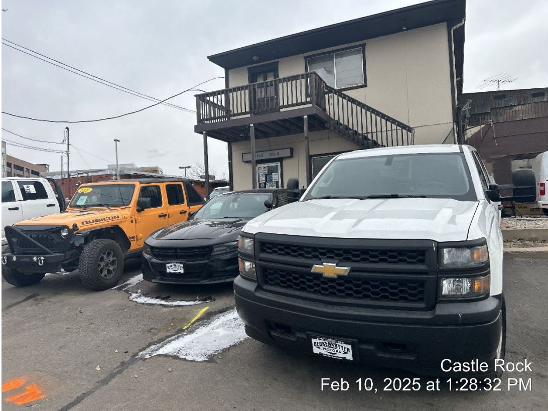
Castle Rock Feb 10, 2025 at 1:28:32 PM