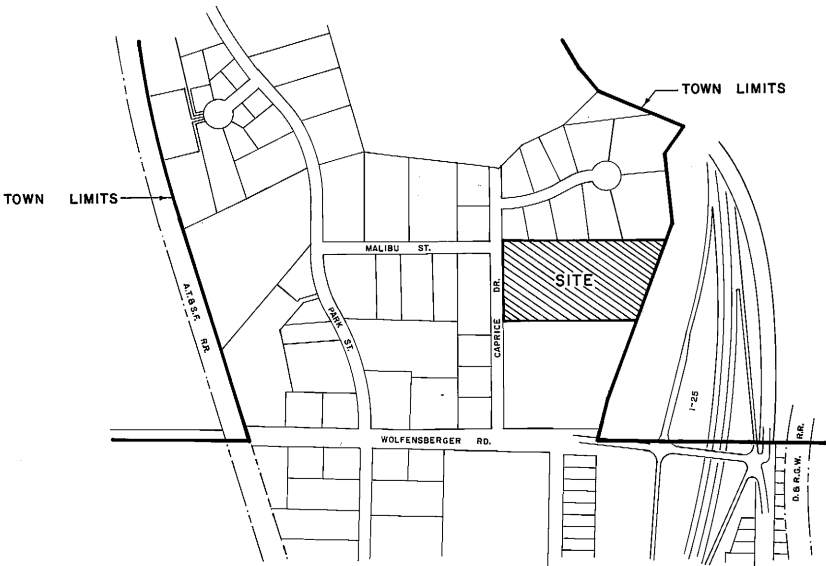
VICINITY MAP 1" = 400'

UNOFFICIAL COPY UNOFFICIAL COPY UNOFFICIAL COPY UNOFFICIAL COPY UNOFFICIAL COPY