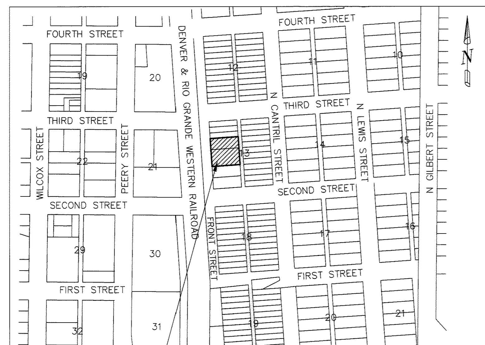
CRAIG AND GOULD'S ADDITION TO CASTLE ROCK 9TH AMENDMENT VICINITY MAP

TOWN OF CASTLE ROCK DOUGLAS COUNTY, COLORADO